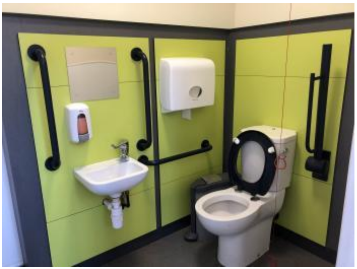
Inside of unisex accessible toilet