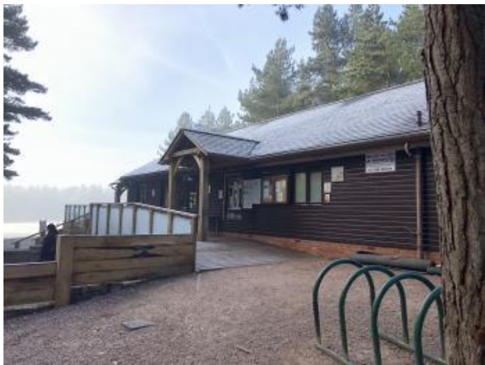
Cafe (external, back)