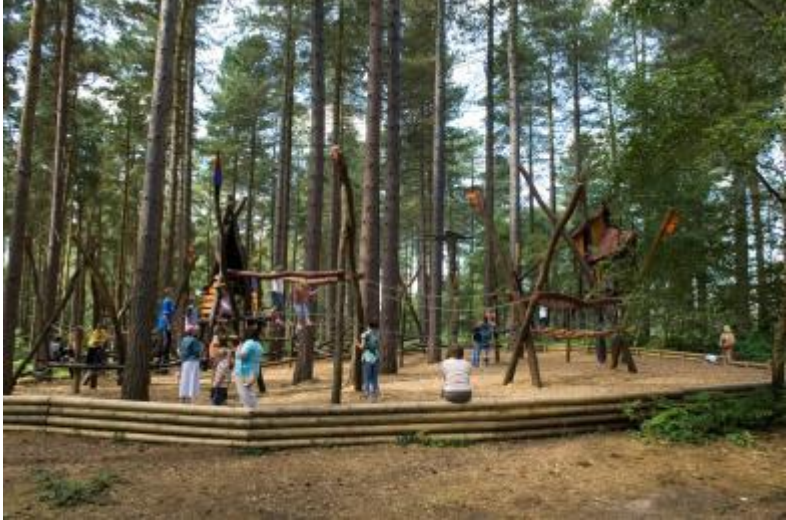
Robin Hood's Hideout