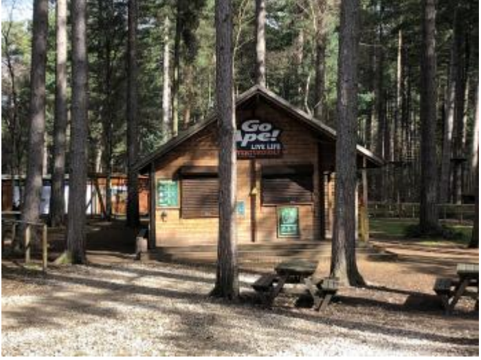
Go Ape booking cabin