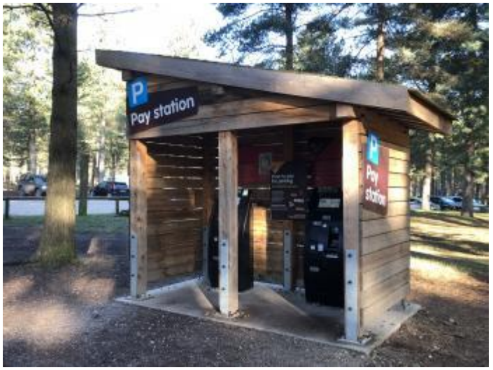
Pay on exit paystation

The car park is on a 'Pay on Exit' system - this means you dont need to do anything when you arrive, you just have to go to one of the wooden paystation huts as you are about to leave, follow the instructions on one of the touch-screen pay machines, and they will know how long you've been on site and how much you must pay. You can pay by coin, card, or Apple pay. The charges are; up to one hour £3, up to two hours £5, anything over two hours £8.