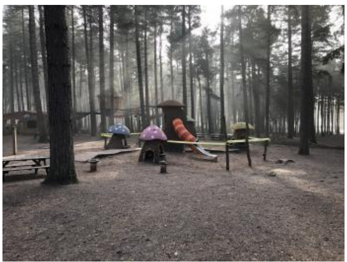
Mushroom Village play area