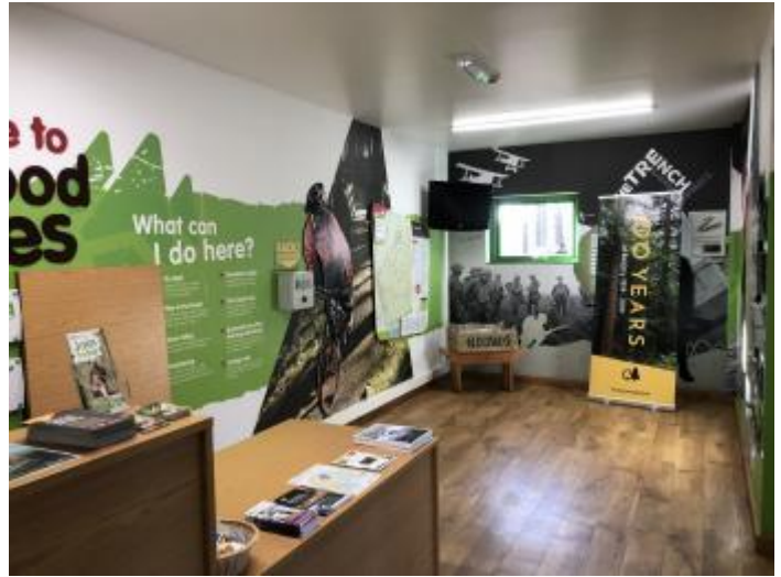
Visitor centre information point